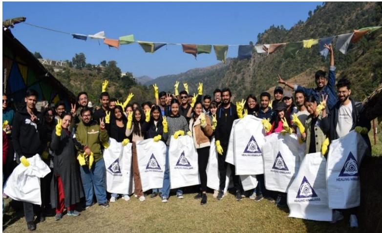
Enthusiastic volunteers before starting the cleaning drive.

Regular cleaning campaigns are organized in and around campus as a part of the Swachh Bharat Campaign. On November 20, 2022, a cleaning campaign was organized at the riverside area near Xanadu Café situated at Ashwani Khadd in collaboration with Healing Himalayas. More than 60 volunteers spent several hours cleaning up the stream which has fallen prey to tourism vagaries.