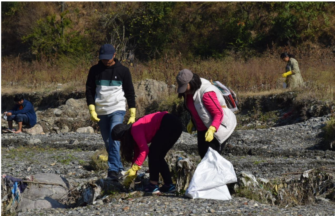
Volunteers picking up plastic at the riverside area

The beautiful water body is often littered with plastic and other garbage. The garbage collection was segregated and sent for proper disposal. After the hard work, the students enjoyed some hot lunch served by Xanadu Cafe. The team from Healing Himalayas interacted with the students sensitizing them about the growing menace of plastic.