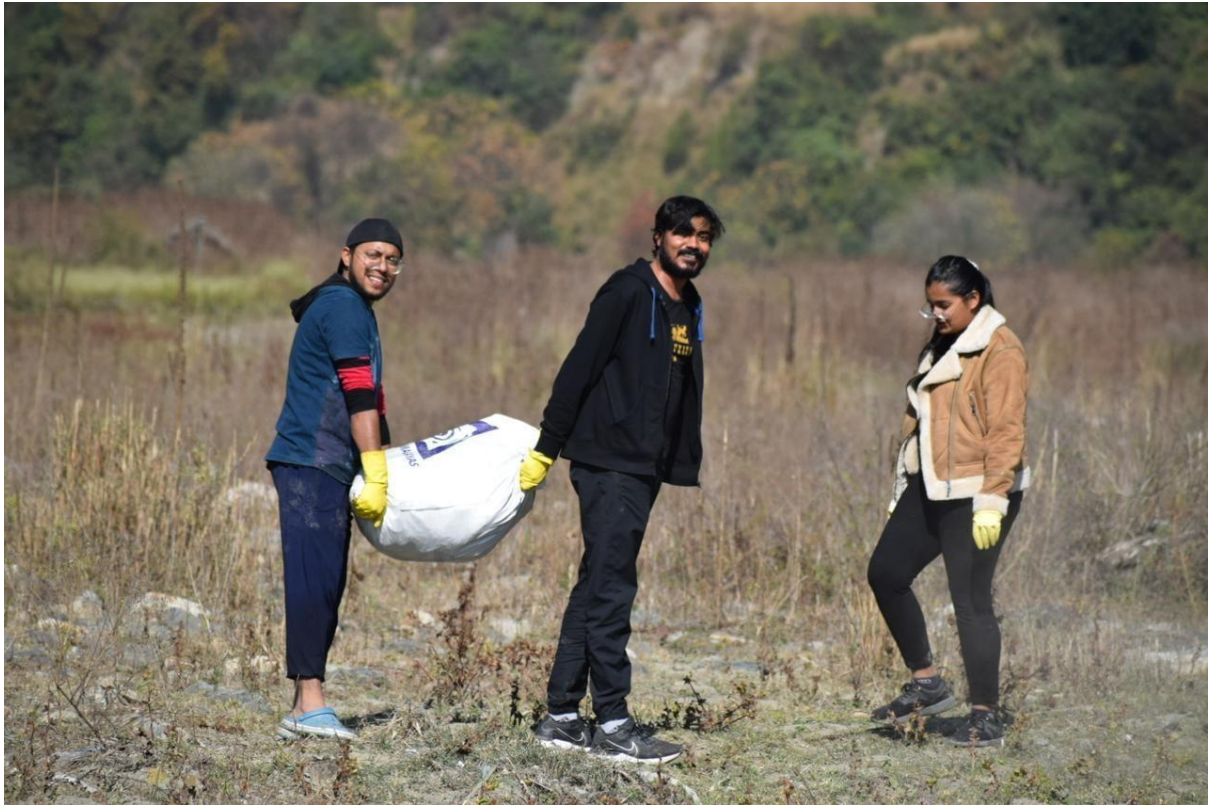
Volunteers carrying bags filled with plastic.