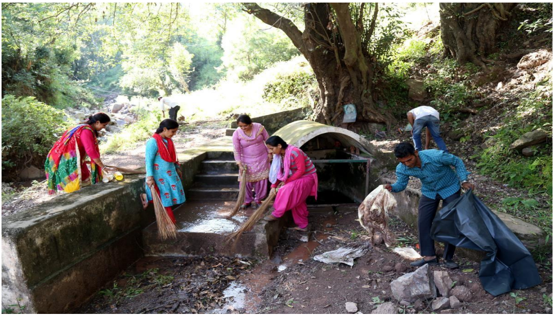
Cleanliness Campaign at Ashwani Khad