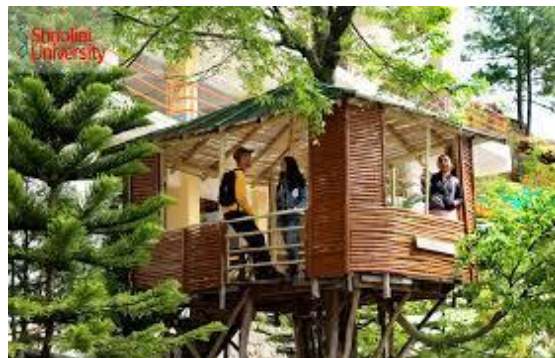
Figure 5: Living with Nature-Eco friendly Bamboo Tree Houses in the campus for student interaction