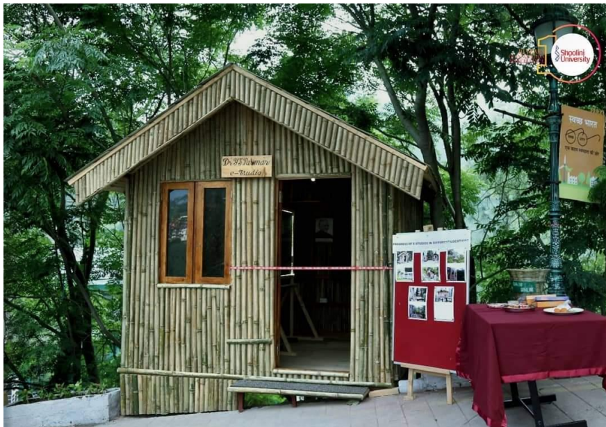
Figure 4: Bamboo and slate Roof E-Studio for online lectures constructed during Covid times