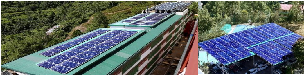
Figure 2: 400 kWp PV power plant installed in the university

Under its Energy policy, Shoolini university has installed a 400 kWp rooftop photovoltaic power plant in the campus to partially meet its energy requirements. As a follow up, all the new buildings are planned to be constructed as energy efficient and solar PV grid integrated plants are planned. The electrical energy used by the university in 2021 was 10,77,700 kWh (3,880 GJ) and out of which 3,41,476 kWh (1229 GJ) was produced by the solar plant.