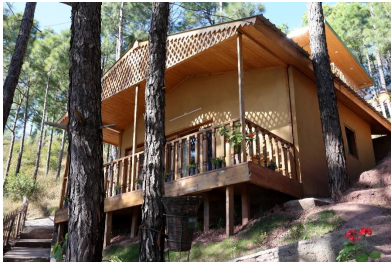
Figure 9: Guest house in Yogananda Ville built with sustainable materials and low carbon footprint