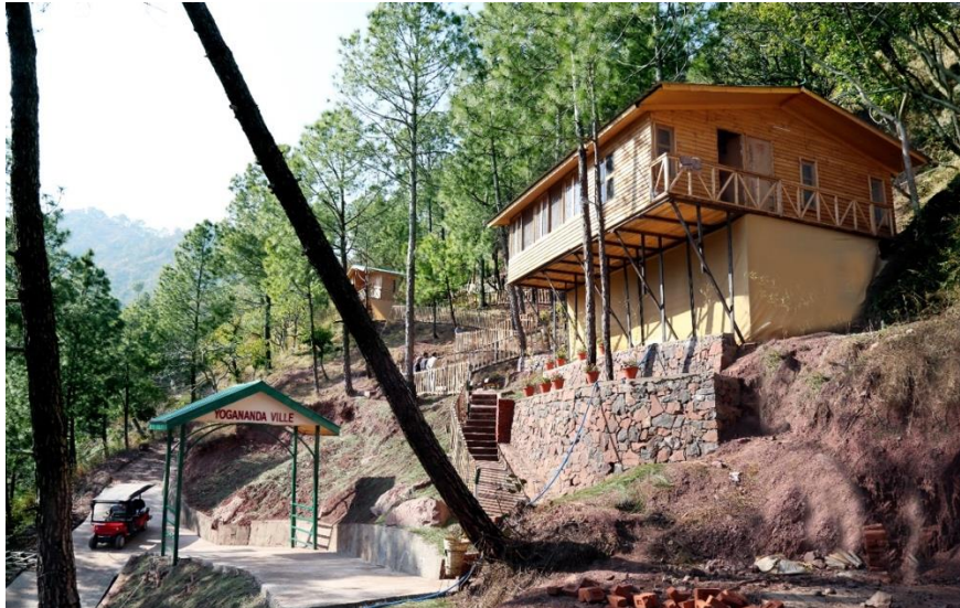
Figure 8: Sustainable Building and Electric Vehicle for transportation in Yogananda Ville in Shoolini University