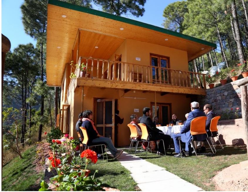
Figure 6: Use of Traditional and Climate responsive Building Materials -Two storeyed houses .