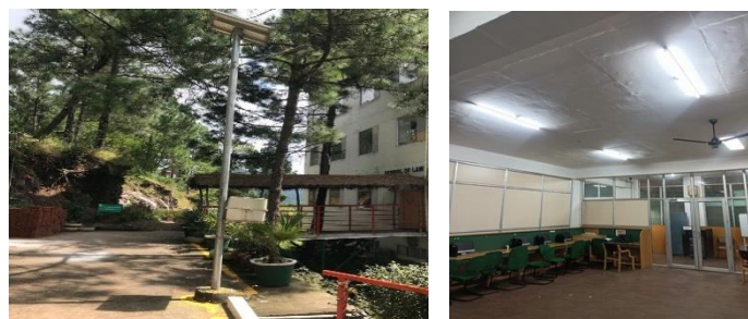
Figure 14: Utilizing clean Solar energy -Solar street lights installed in the university Campus(left) and use of energy efficient LED lights inside the university buildings (right)

Solar streetlights are installed throughout the campus for lowering the dependence on conventional electricity and utilising clean energy sources. Also 90% of the university lights have been replaced with energy efficient LED lights.