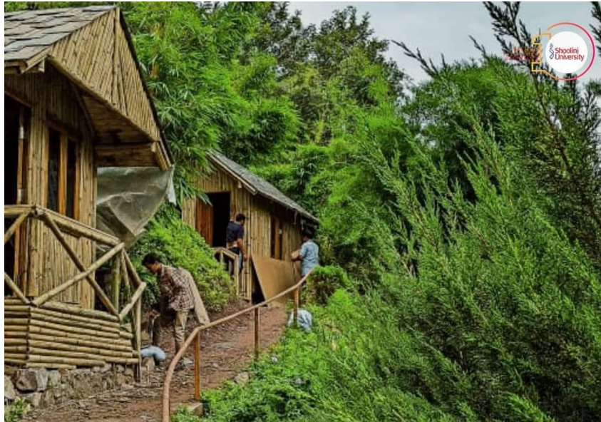
Figure 3: Wooden huts /houses in Yogananda Ville at Shoolini University.