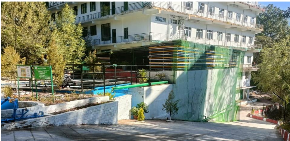
Figure 15: Sewage and waste water treatment plant at Shoolini University

A Sewage Treatment Plant of capacity 3,50,000 lpd and Effluent Treatment Plant of 50,000 lpd capacity, are installed in the campus for the treatment of sewage water and waste water coming from the hostels and research laboratories respectively (figure-15). Recycled water is used for irrigation of gardens, fields and lawns.