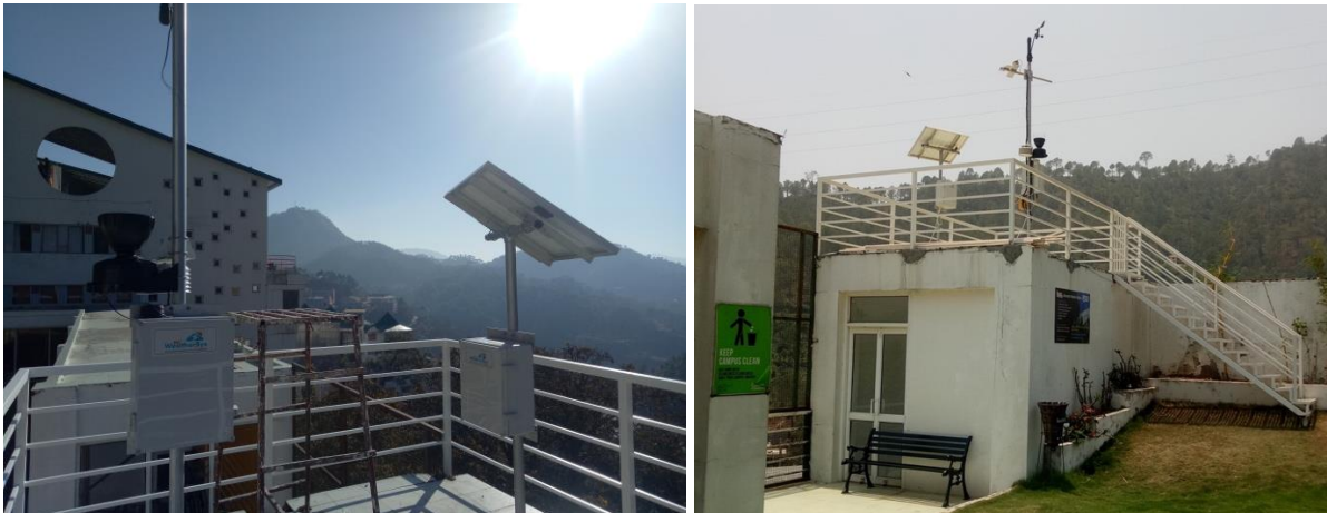
Figure 8: CEEST Automatic weather station installed at Shoolini University.

CEEST has installed a high quality automatic weather station on the roof top of the library building that monitors Global Solar Irradiance, Wind Speed, Wind Direction, Temperature, Relative Humidity, Rain fall data as well as photosynthetic active radiation which are critical for research and development of new Energy technologies, Climate Change related hence contributing towards research and development SDG-7 and SDG-13. The data are being used in boosting the reliable research and development of renewable energy technologies, by utilization of the renewable resources, and making plans for the sustainable township.