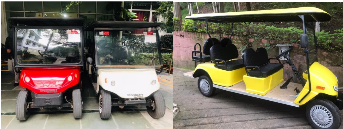
Figure 11: Electric vehicles used for transport within the university campus to reduce carbon emissions.

Non-polluting electric vehicles are used for in-campus transport as shown in figure-11.