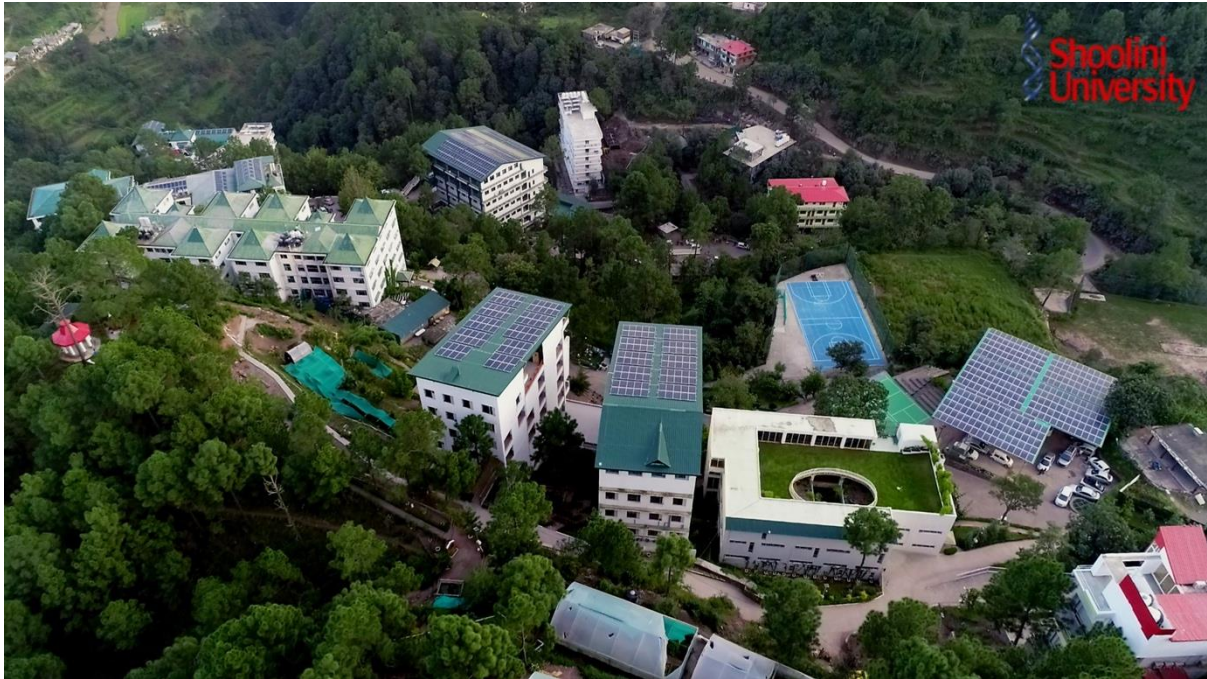
Figure 10: Aerial view of Green Campus various academic blocks of Shoolini University with visible tree plantations and photovoltaic power plants installed.