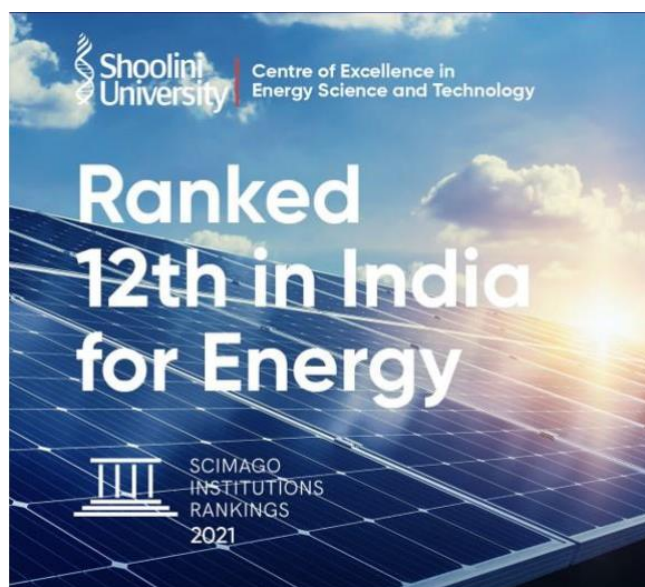
Figure 1: CEEST was ranked 12 th in Energy Research in Indian Universities as per SCIMAGO Rankings 2021

Website link: https://shooliniuniversity.com/center-of-excellence-in-energy-science-and-technology .