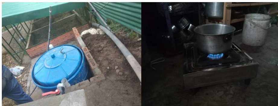
Figure 13: Biogas system installed in agricultural farm at Shoolini University