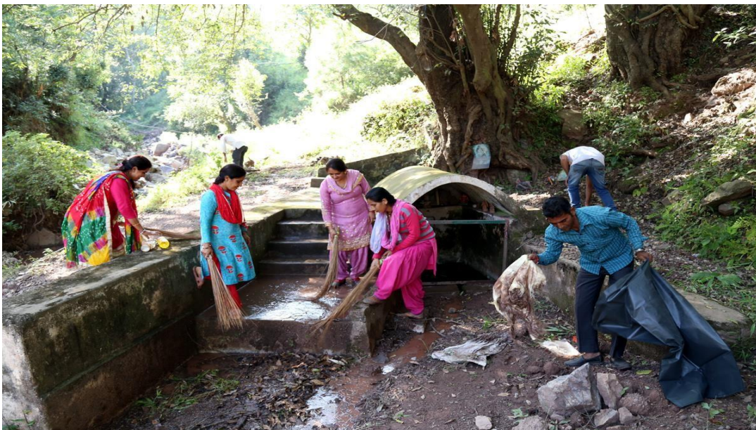
Cleanliness Campaign at Ashwani Khad