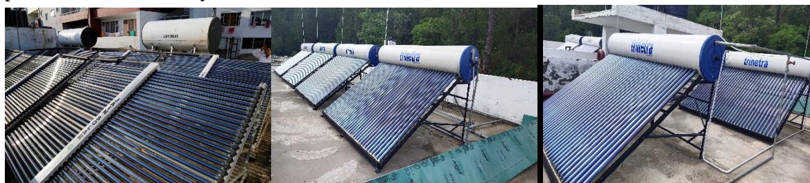
Figure 4: Installation of 38000 litres per day solar water heating systems in the university campus.

Solar flat plate collector and evacuated tube collectors are installed in all hostels of the University provide hot water daily for hostel residents.