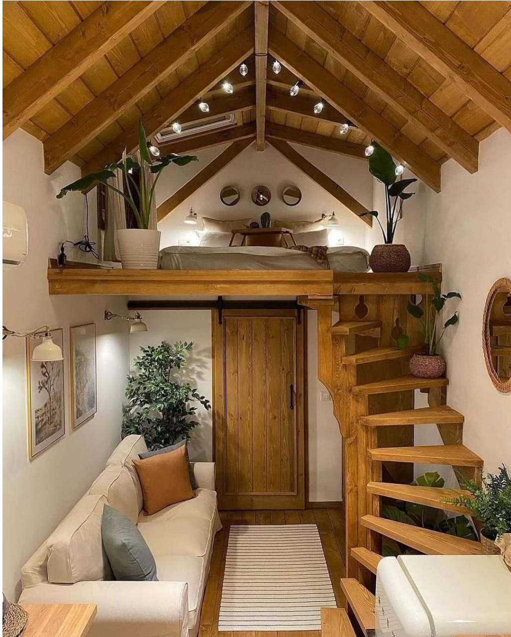
Figure 21: Interior of one of the residential guest huts