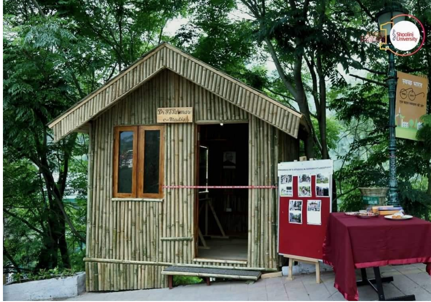
Figure 16: Bamboo and slate Roof E-Studio for online lectures constructed during COVID times