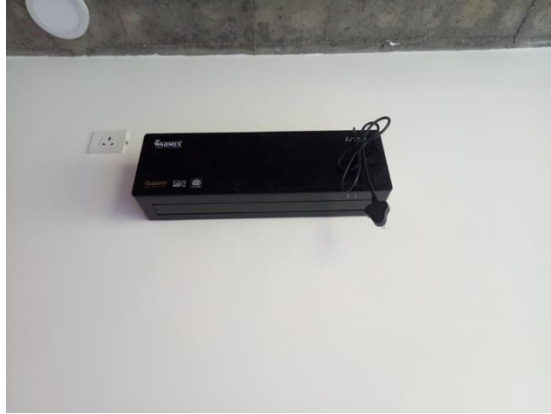
Figure 11: Energy efficient PTC air heaters have been installed all international hostel rooms

Use of energy efficient architectural features: The university has incorporate various feature in the new buildings like use of natural lighting and solar energy, use of Autoclaved Aerated Concrete (AAC) blocks, ‘Rat Trap’ Builds i.e. cavity induced in wall which provides the advantage of thermal comfort.