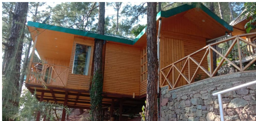
Figure 20: Sustainable energy building in Yogananda Ville at Shoolini University.