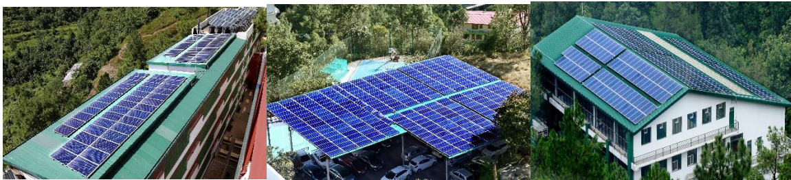
Figure 2: Distribution of 400kWp grid-connected Solar Photovoltaic Power Plant on different rooftops and Car parking shed in the University campus