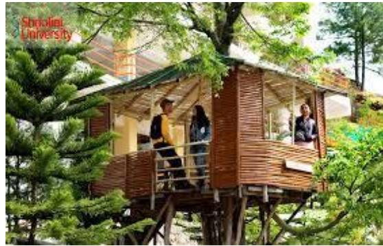
Figure 17: Living with Nature - Eco friendly Bamboo Tree Houses in the campus for student interaction