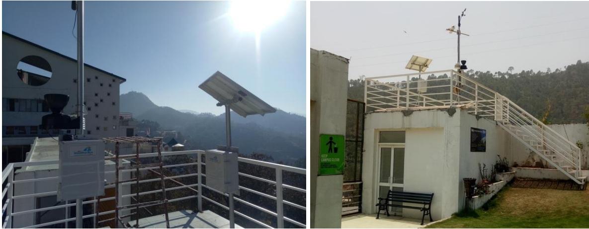
Figure 8: CEEST Automatic weather station installed at Shoolini University.