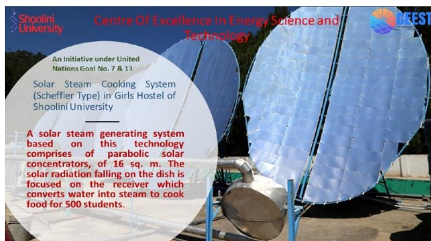
Fig 3a Concentrated solar powered community steam cooking system

The solar radiation falling on the dish, is concentrated onto a receiver, which heats the water and convert into steam to cook food for 500 girl students residing in the hostel saving about 2 LPG gas cylinders every day thus saving conventional fuel and money. The system is also used as a research facility by the PhD student to design and monitor the performance of the CSP system.