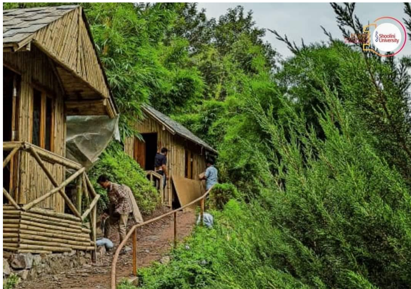
Figure 15: Wooden huts /houses in Yogananda Ville at Shoolini University.

Under the mandatory Net Zero Energy and Passive Solar housing Policy, the university has developed a Yoga Nanda Ville with a number of solar huts in the campus using sustainable building materials like wood, bamboo, slate, stone, mud, stabilized mud blocks etc. shown in figure-10 to 14.