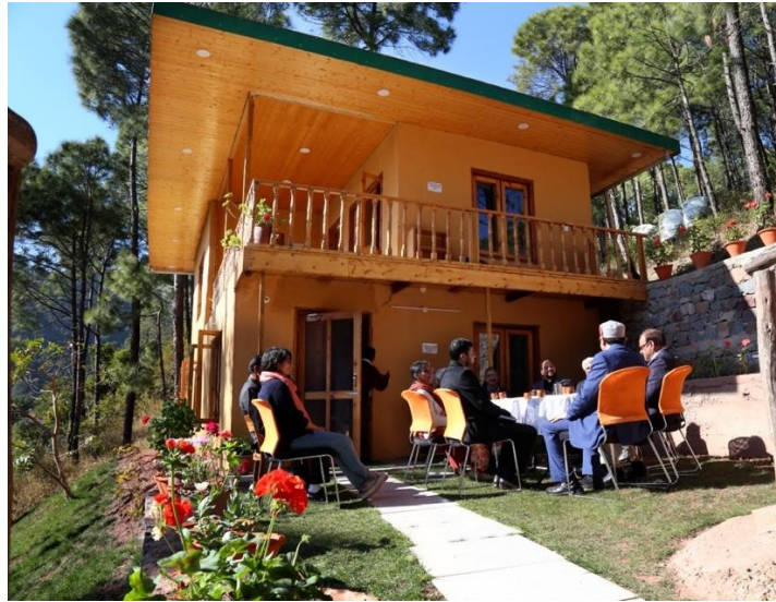
Figure 18: Use of Traditional and Climate responsive Building Materials -Two storeyed Guest House.