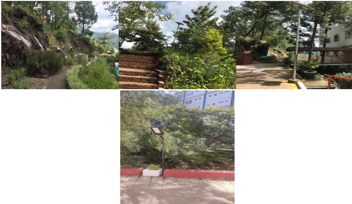
Figure 7: Solar streetlights installed in the University campus.

Shoolini University has installed a 42 solar street lights of 40W capacity inside the campus for night time lighting purposes thus utilizing free Solar energy and saving conventional electricity.