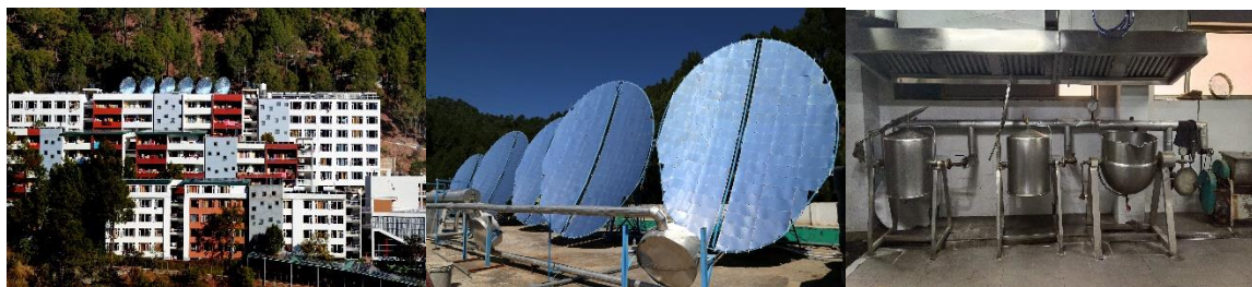
Figure 3b: Concentrated solar steam cooking system installed on roof top of the Shoolini University

The solar radiation falling on the dish, is concentrated onto a receiver, which heats the water and convert into steam to cook food for 500 girl students residing in the hostel saving about 2 LPG gas cylinders every day thus saving conventional fuel and money. The system is also used as a research facility by the PhD student to design and monitor the performance of the CSP system.