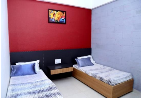
Figure 13: Walls using AAC blocks for better insulation and energy efficiency