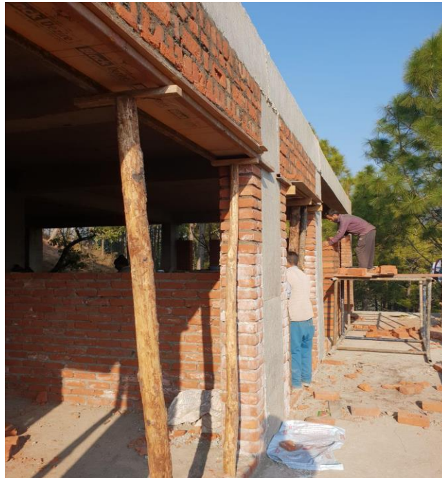
Figure 14: Walls with Rat traps for better insulation and thermal comfort