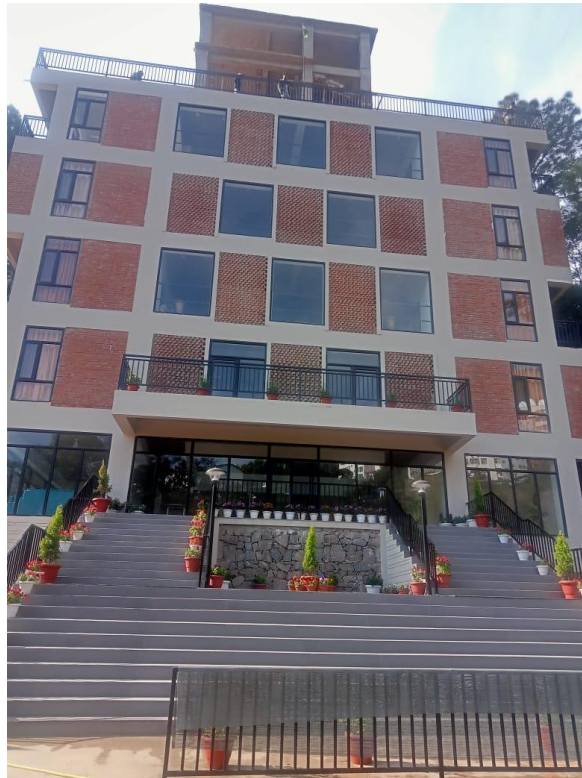
Figure 12: Use of large windows for increased solar gain and increased use of natural lighting.

Use of energy efficient architectural features: The university has incorporate various feature in the new buildings like use of natural lighting and solar energy, use of Autoclaved Aerated Concrete (AAC) blocks, ‘Rat Trap’ Builds i.e. cavity induced in wall which provides the advantage of thermal comfort.