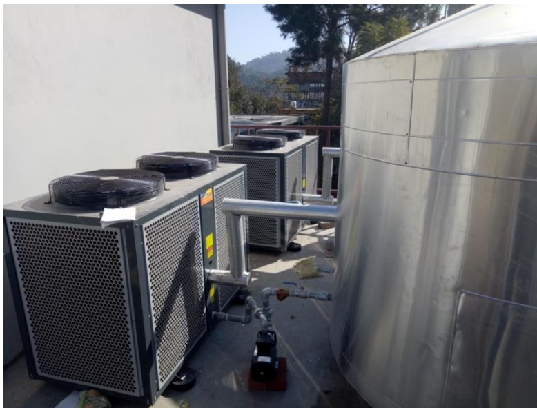
Figure 10: Energy efficient heat-pump based water heating system has been installed in the international hostel Shoolini University

Use of more efficient water and air heating systems: The university has installed 8kW heat pump based water heating system in the international hostel and PTC air heaters to optimize and improve energy efficiency.