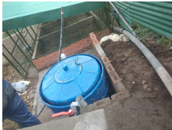
Figure 6: Biogas plant for cooking installed in agriculture farm in Shoolini university

In order to utilize agriculture, cow dung, food waste and kitchen waste, and promote the research and use of biogas as the fuel, the CEEST has installed a 1.5 m 3 Plastic biogas system for demonstrating use of non-polluting fuel in the agricultural farm of the University which is being used for cooking by the farm laborers.