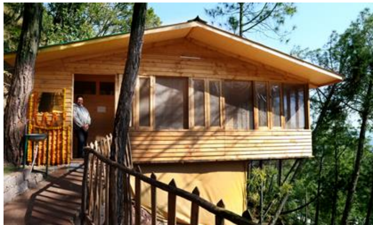
Figure 19: Sustainable energy building in Yogananda Ville at Shoolini University.