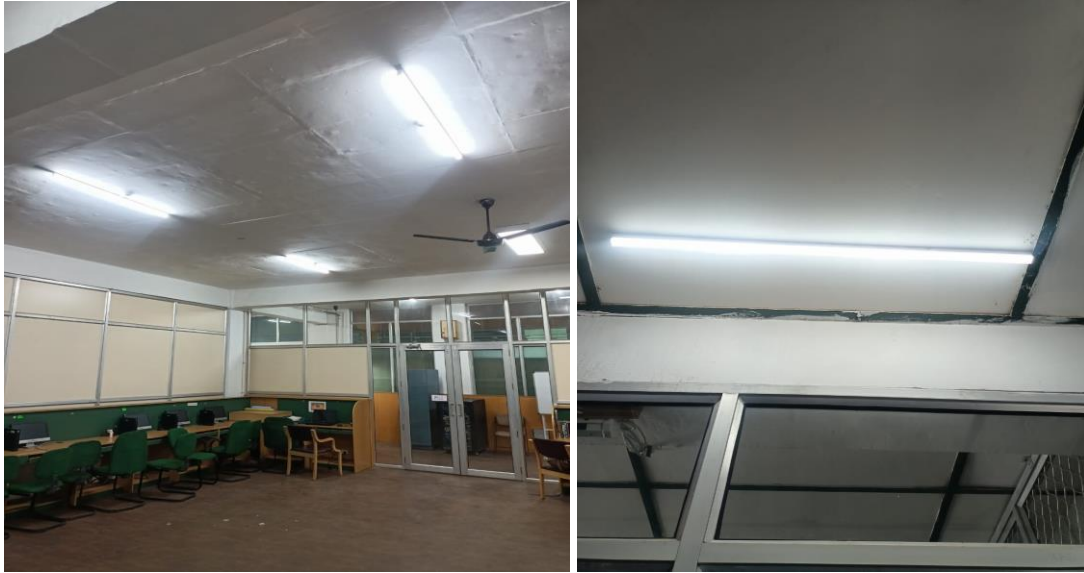
Figure 9: 20W LED lights installed in the University

Use of more efficient water and air heating systems: The university has installed 8kW heat pump based water heating system in the international hostel and PTC air heaters to optimize and improve energy efficiency.