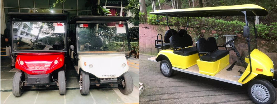
Figure 5: Electric Carts for local transportation in the university campus.

The university has introduced three electric carts for local transportation for students, faculty and visitors inside the university campus to restrict the movement of personal vehicles inside the campus during working hours.