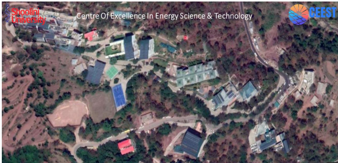
Figure 1: 400 kWp Grid connected Solar Photovoltaic Power Plant at Shoolini University

Solar Energy is harnessed through Solar Photovoltaic panels installed on the rooftops of the University building blocks, hostels and car parking. The University campus is connected to the main grid operated by HP State Electricity Board (HPSEB). The solar electricity so generated is used to meet the partial energy needs of the University. The electrical energy used by the university in 2021 was 10,77,700 kWh (3,880 GJ) and out of which 3,41,476 kWh (1229 GJ) was produced by the solar plant.