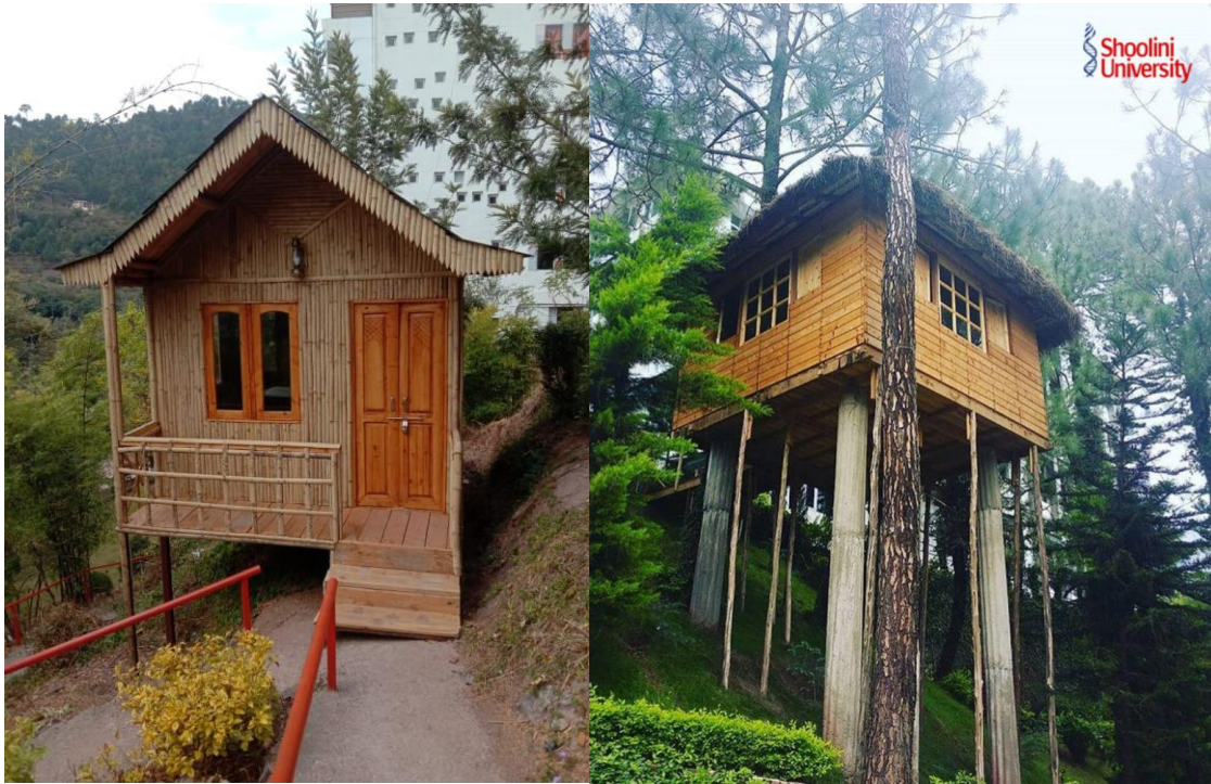
Figure 20: Sustainable hut near academic blocks(left) and a tree house in the campus (right)